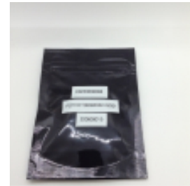
Cannaboids (% weight)